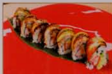
1. Eel Special Roll