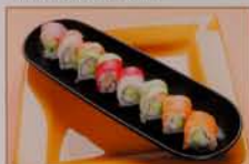
3. Rainbow Roll