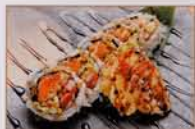
1. Salmon Tempura Roll

3 Pieces of Sushi (Tuna, Salmon, Albacore) and Choice of