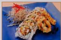
2. Calamari Tempura Roll