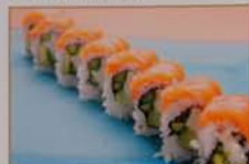
4. Philadelphia Roll