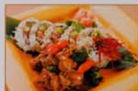
3. Chicken Teriyaki Roll