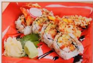
4. Shrimp Tempura Roll