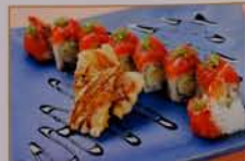
2. Hot Night Roll