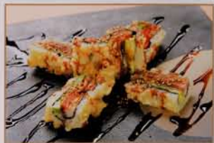
5. California Tempura Roll